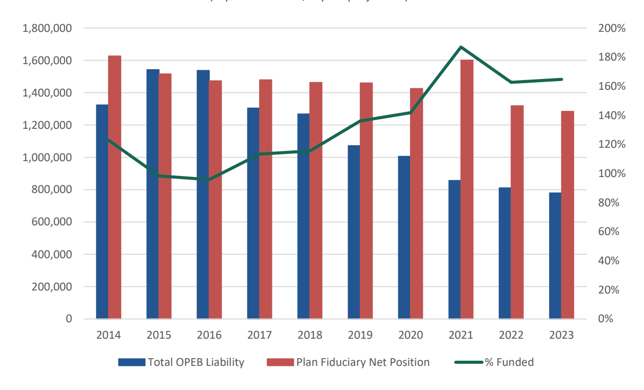
Funded Status (9-year historical, 1-year projection)

Below is an illustration of the funded status of the Plan for the past 9 years, and a projection of the next year looking forward: