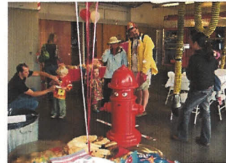
Pluggie the Fire Hydrant entertains an Open House crowd

We look forward to seeing you on the 17th!