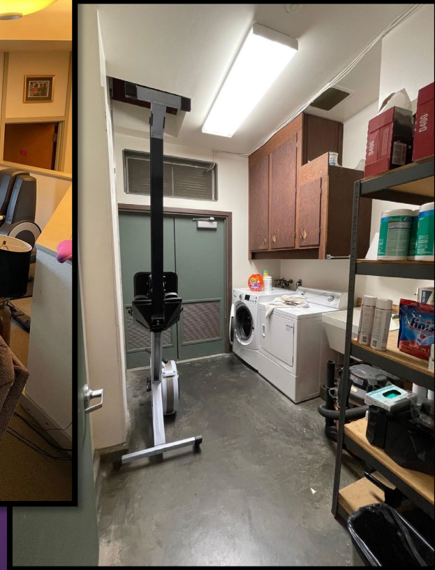
Laundry / Egress to Parking