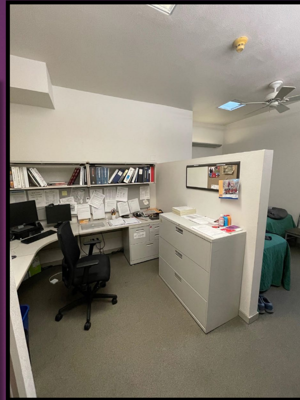
Medic Office in Bedroom