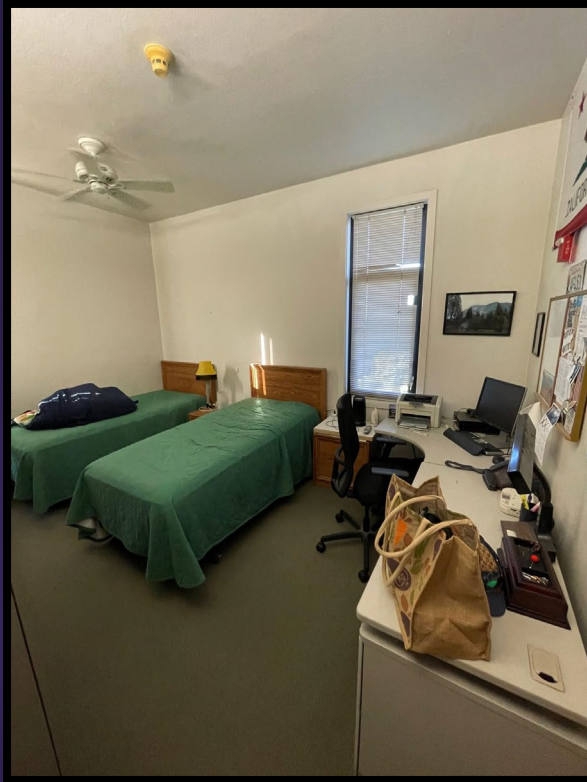
Offices in Bedrooms