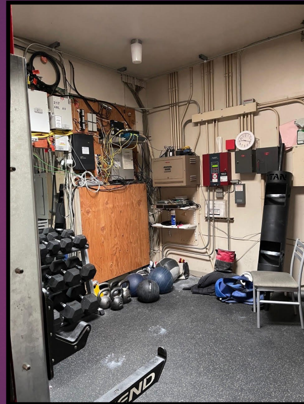
Elect Rm / Exercise Rm